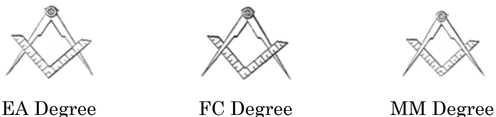
Figure 1 – Square and Compass Layout for Degrees

NOTE: The tips of the compasses and the angle of the square should be as shown.