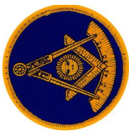
Past Masters Badge