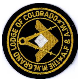
District Lecturer Badge