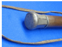
Image of Abraham Lincoln's Walking stick