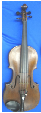
Image of Thomas Jefferson's violin

The travelling museum contains items which are significant to both Masonic history as well as general history.